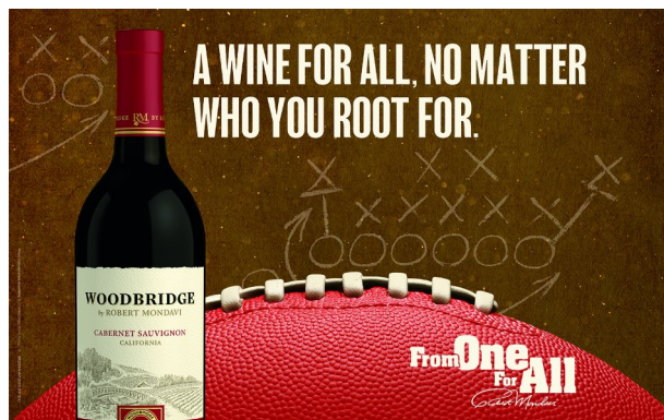
Woodbridge new football campaign