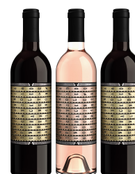
The Prisoner Unshackled